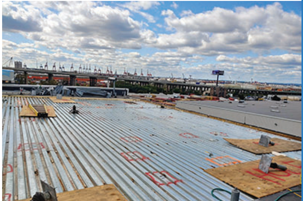
Left: Removal of the solution prep module utilizing a 350 ton crane. Above: We had to remove portions of the roof and decking to create the openings where the equipment could be removed for relocation.