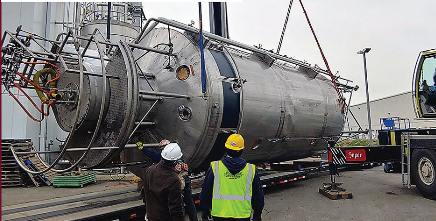
Above: We utilized yellow hydraulic gantry jacks to boost these processing units so that they could be lifted with a 350 ton crane. Left: You can see the units being lifted and put onto a lowboy for transport to their new locations.